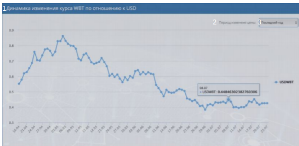
WBT course dynamics